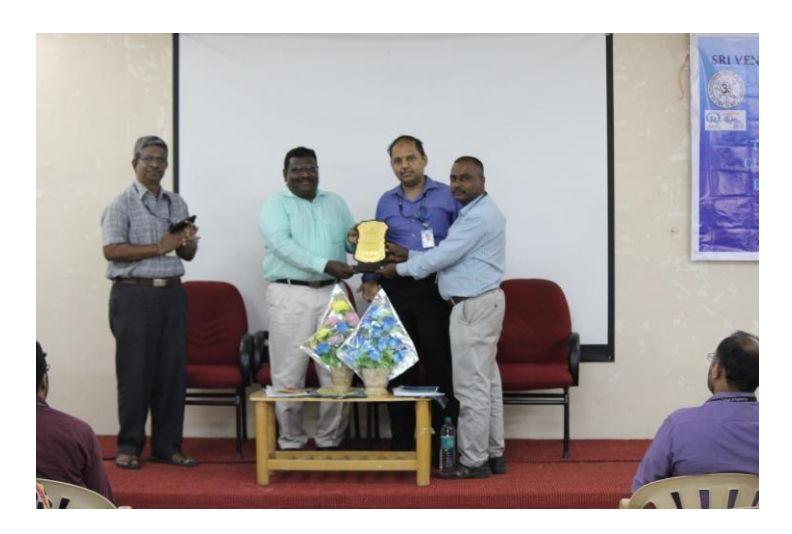
Valedictory Function Photos