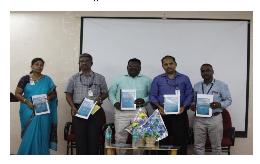
Guest Lecture Photos